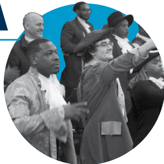
RTA members during the production of 1776 at Sing Sing Correctional Facility

“Where the prison culture preaches every man for himself, RTA stresses that each member is needed for the group to be whole.”